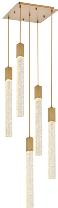
Stain Gold Item No: 2066D16SG