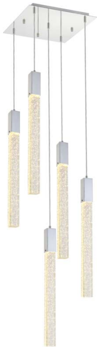
Chrome Item No: 2066D16C